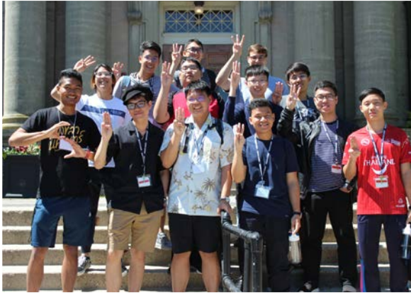
SARGENT 3 DORM