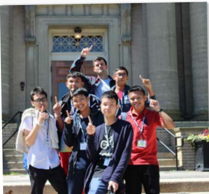
SARGENT 1 DORM

the Office of Educational Affairs (OEADC), and took some time to take a few photos! It was a beautiful, sunny day!