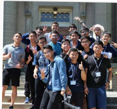
SARGENT 2 DORM