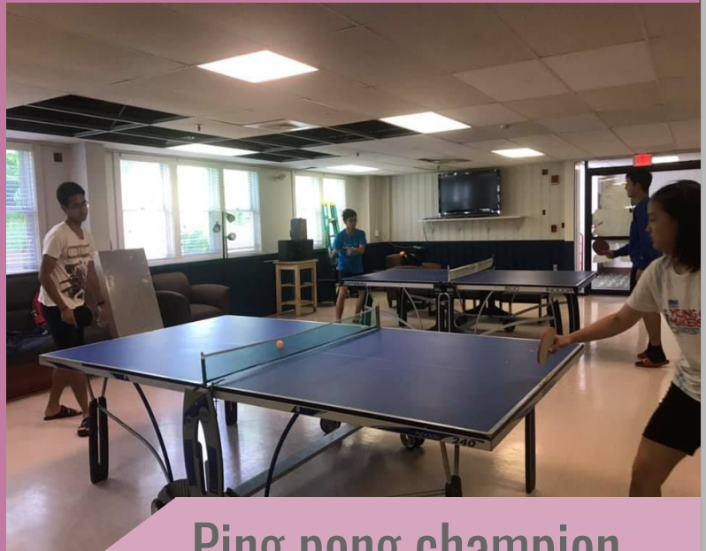
Ping pong champion

"In Honolulu, we always go to Bobcat den after we finished our lunch to play Pingpong."